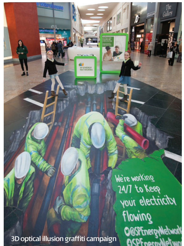
3D optical illusion graffiti campaign

How to access additional services – learning about the additional services we can offer through our network of partner agencies.